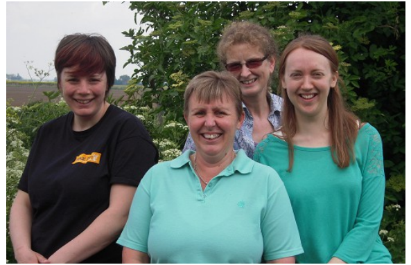
Great Fen Archaeology team

Great Fen Archaeology Group is our newest AAG. The group are closely associated with the Great Fen Local History Group, an active group of Great Fen and Ramsey Rural Museum volunteers, working alongside the Great Fen team. At present the group are researching a collection of fishing weights excavated near Whittlesey Mere in the 1990s. In the autumn the group will be fieldwalking near Engine Farm in the north of the Great Fen, and in autumn 2015 will be involved in the Spitfire Project. Professional archaeologists (Oxford Archaeology East and Cranfield University) will recover the aircraft, and local volunteers and members of the Great Fen Archaeology Group will also be involved.